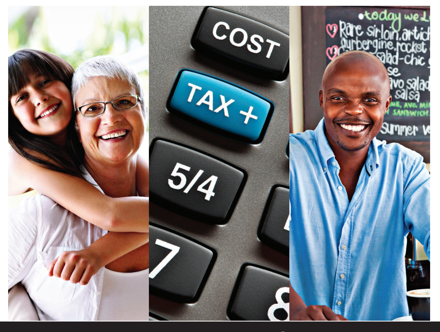
Tax Law Snapshot for the 2013 Filing Season