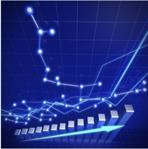
Fundamental metrics based on the operations of individual companies also can be aggregated and averaged to suggest the state of an index comprised of those stocks.