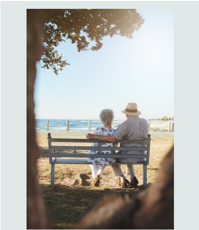
About 41 million people are participants (active, retired, or separated vested) of PBGC-insured corporate pension plans.