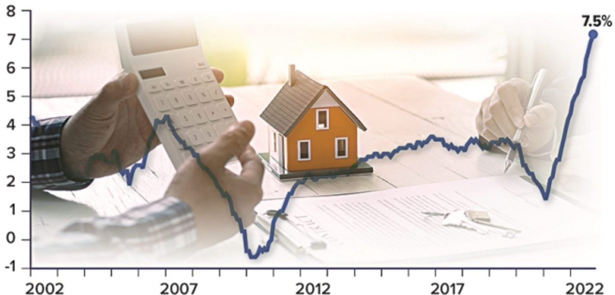
12-month change in shelter costs (CPI-U)